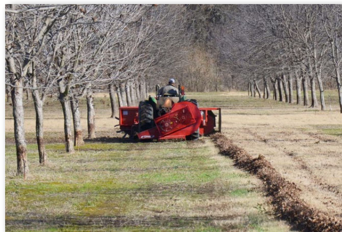
The 7510 Sweeper and 5132 Blower are a tremendous labor-saving duo.

Savage's 3-point blower is finely balanced for speed and efficiency. The powerful air stream moves nuts, leaves and sticks from under the trees which will make your sweeper and harvester more effective.